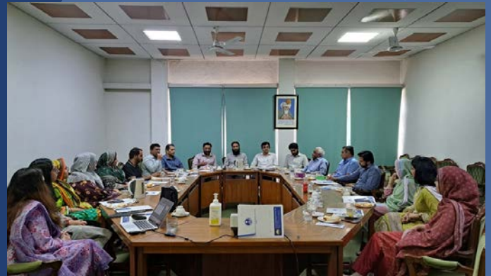
7 th IAB meeting of IEER

May 23 rd and December 11 th , 2023, respectively. The discussions included exploring opportunities for collaboration and co-advisership in Final Year Design Projects. Additionally, the 8 th IAB meeting extensively addressed curriculum revision, capturing valuable suggestions of IAB members for consideration. Esteemed guests from NESPAK, MMP, EPD, WASA, WWF-Pakistan, PCSIR, GCU, and LWMC attended these meetings.