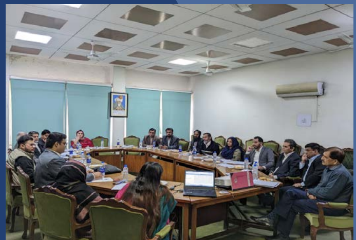
8 th IAB meeting of IEER